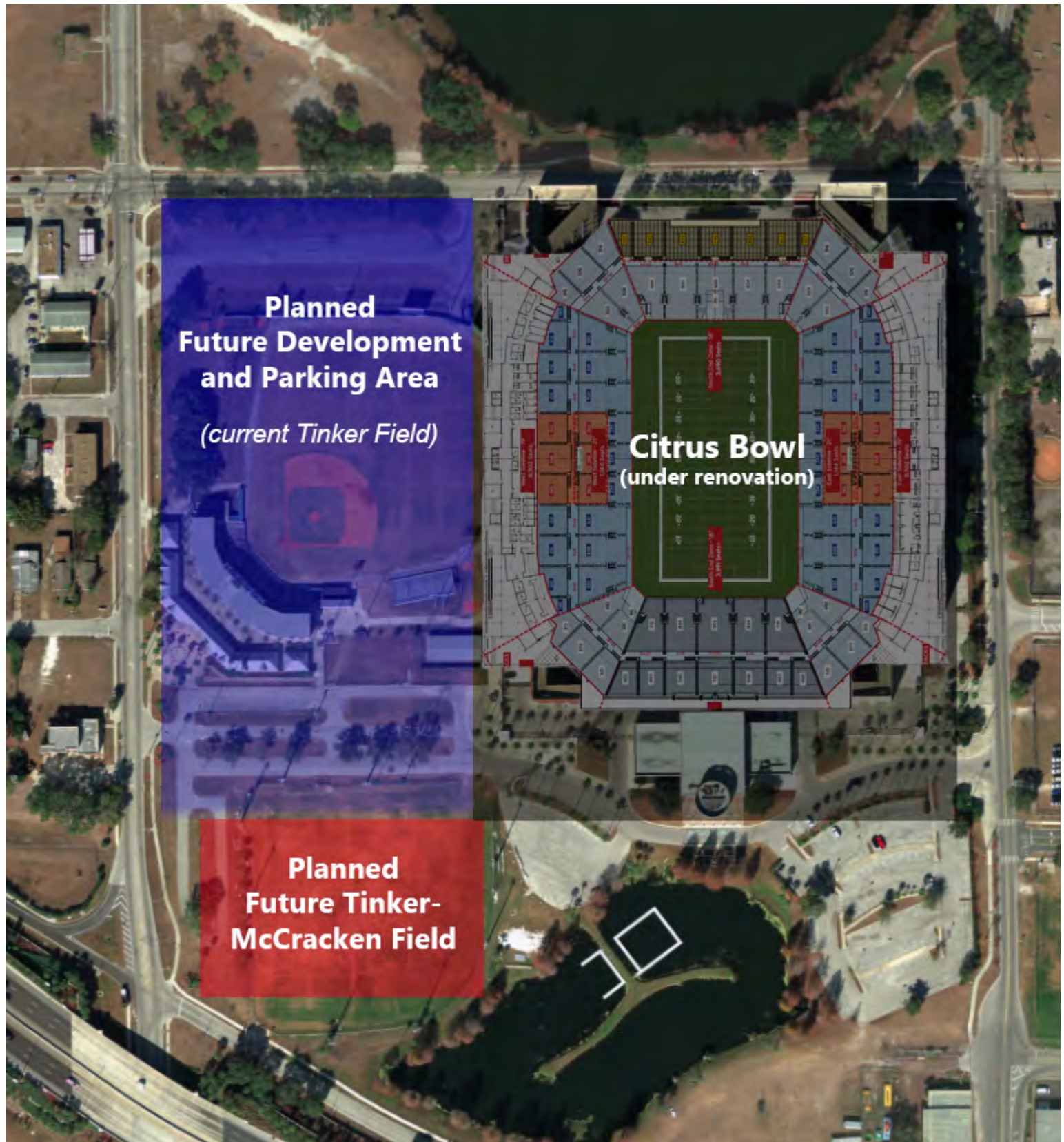
Exhibit "A" Existing Conditions